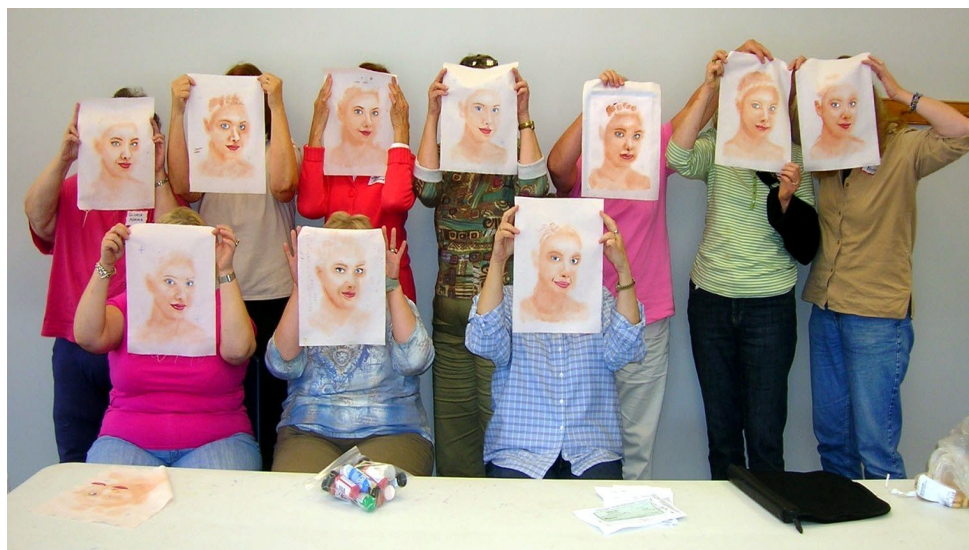
Who are these people? Really? See page 2.